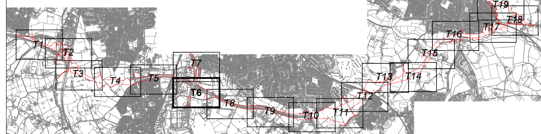
Location Plan (Scale 1:50,000)

Note: Localised areas of trees and woody vegetation within the red line Planning Application boundary but not referenced on site plans or within the Schedule of Existing Trees, will be retained protected during construction operations.